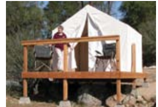
2-person cabin-style tent on raised platform. 2 cots, 2 deluxe pads, 2 deck chairs. Hummingbird, Sparrow, Kingfisher

South Fork Luxury Camping —largest rafting campground on the South Fork. Beautiful raised tents 100' from river with views, hot showers, flush toilets, special "swimming holes" right in front of campground ...plus volleyball, horseshoes, covered pingpong area, walk-in campstore, beverage garden, coffee corner, delicious food...and more! Visit mariahwe.com for an on-line store