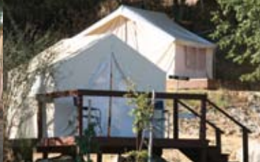
B. 4-person cabin-style tent on raised platform. 4 deluxe pads. Mulberry, Acorn, Berry, Poppy.