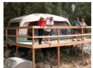
Large verandas on both Falcon's Nest and Eagle's Nest.