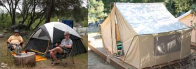
A. 2-person dome tent