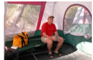
Shows deluxe cot and deluxe pad included with C. & D. tent rentals.