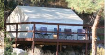
D. 5-person cabin-style tent on raised platform. Up to 5 cots, 5 deluxe pads, 5 deck chairs. Eagle's Nest, Falcon's Nest. Large verandas.