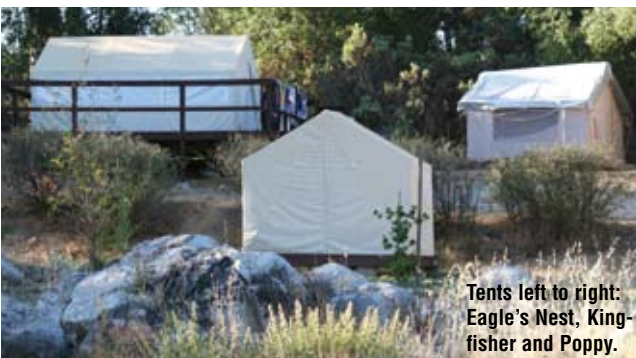
Tents left to right: Eagle's Nest, Kingfisher and Poppy.

South Fork Luxury Camping —largest rafting campground on the South Fork. Beautiful raised tents 100' from river with views, hot showers, flush toilets, special "swimming holes" right in front of campground ...plus volleyball, horseshoes, covered pingpong area, walk-in campstore, beverage garden, coffee corner, delicious food...and more! Visit mariahwe.com for an on-line store